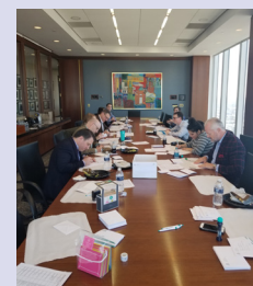
ACTS volunteers write thank yous to donors