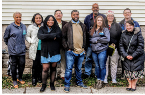
The ACTS Team at a Home Sale event